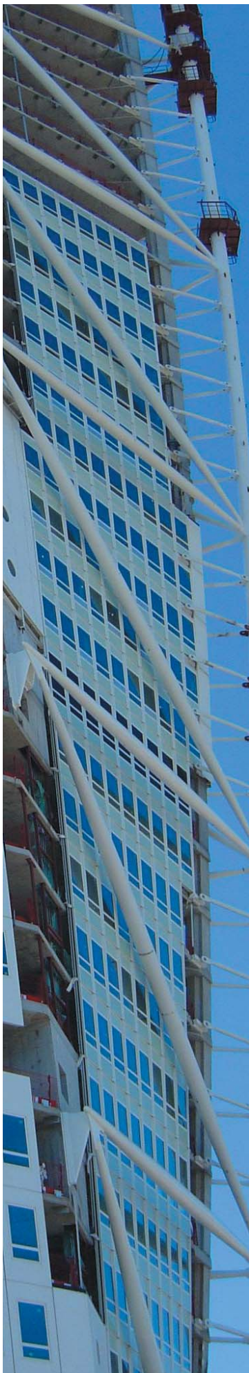
Twisting Torso, Malmö