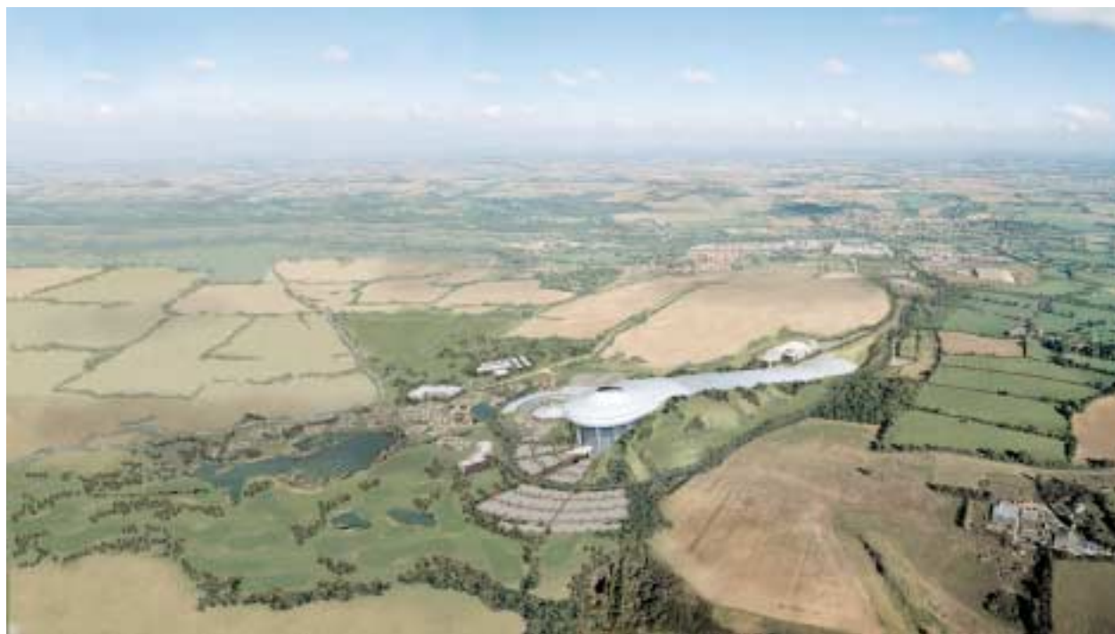
Planned site for Snoasis, Image Courtesy of Snoasis.